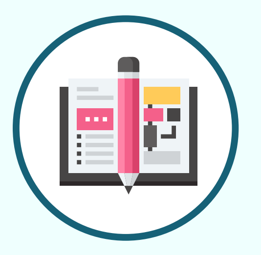
Determine what equipment and planning will increase safety and decrease risk.