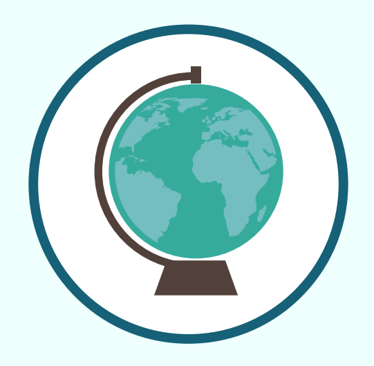
Identify essential vs non-essential staff by geographic location and role.